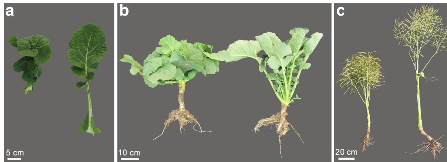
Fig. 1 Morphological characters of the Bndwf/dcl1 mutant and its wild-type. a Leaf phenotype at the seedling stage of the Bndwf/dcl1 mutant (left) and its wild-type (right). b Phenotype at the seedling stage of the Bndwf/dcl1 mutant (left) and its wild-type (right). c Phenotype at the mature stage of the Bndwf/dcl1 mutant (left) and its wild-type (right)

verified to have the same inheritance segregation mode as the F_2 population (Table 1). Thus, we infer that the dwarf architecture with down-curved leaf trait is controlled by a single dominant gene.